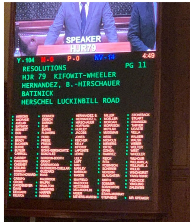
(The IL House voting board displays unanimous support for HJR0079)

HJR0064 declares June 12, 2022 as "Women's Veterans Day" to commemorate the day women were officially added as regular members of the United States military, recognizing the critical role of women in the military, and to commemorate the sacrifices and valor displayed by Illinois women Veterans.